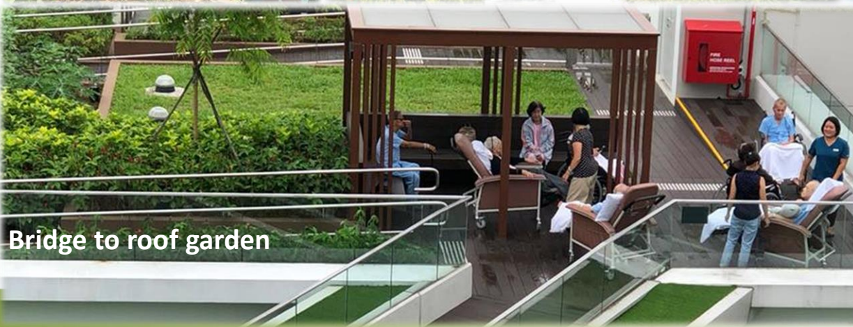
Bridge to roof garden