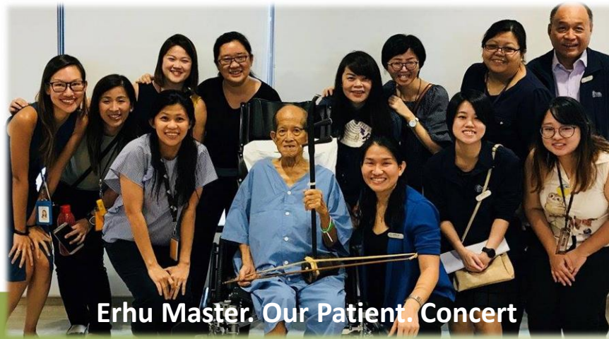
Erhu Master. Our Patient. Concert