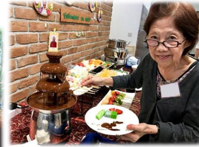
Music . Art . Makan