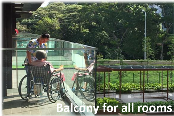
Balcony for all rooms