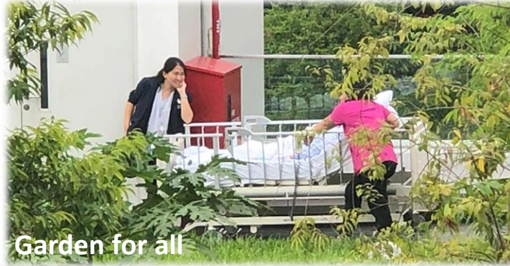
Garden for all