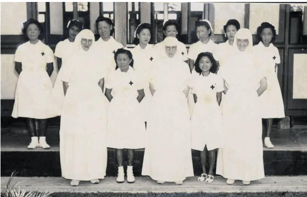
Set-up Nursing & Education for Leprosy