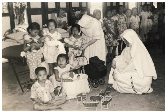
Christmas celebration, Trafalgar Home 1951 Previously known as ‘The Leper Camp’