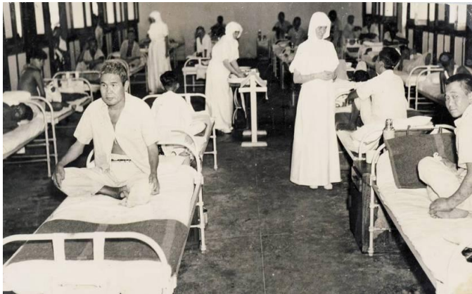
FMDM Sisters provided Tuberculosis Nursing