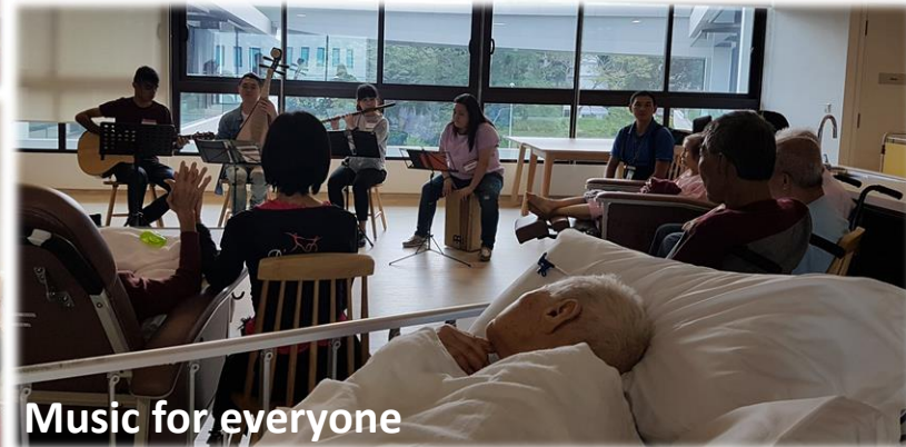
Music for everyone