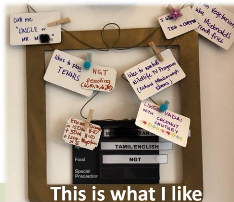
This is what I like