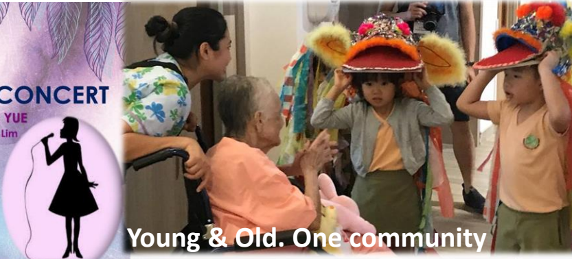
Young & Old. One community