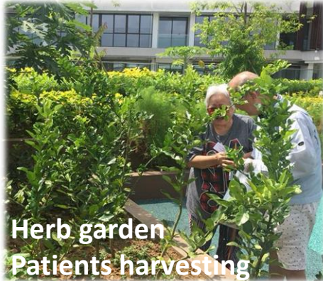
Herb garden Patients harvesting