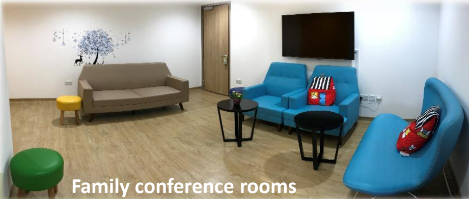
Family conference rooms