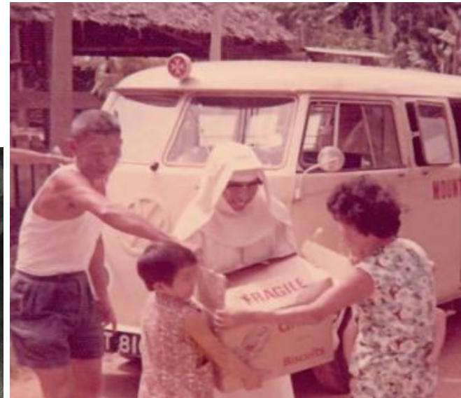
Giving to the community