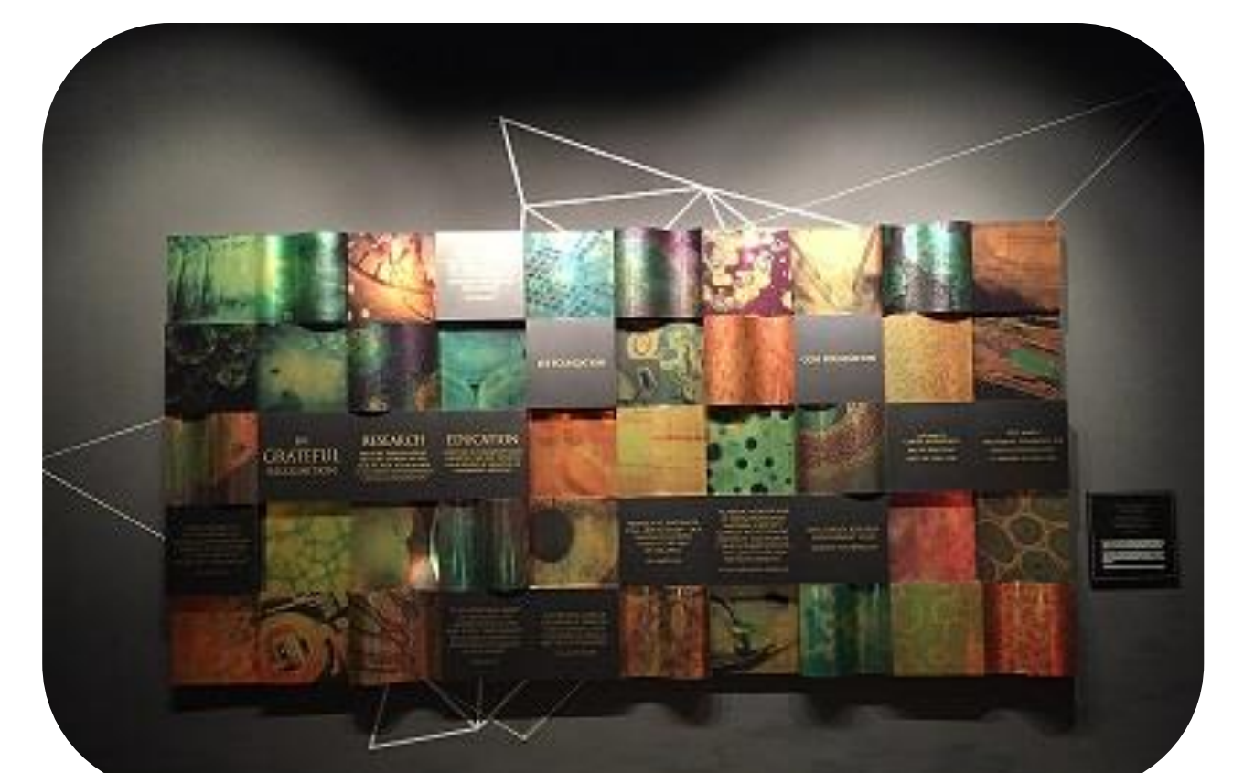
Donor Recognition Wall at Academia