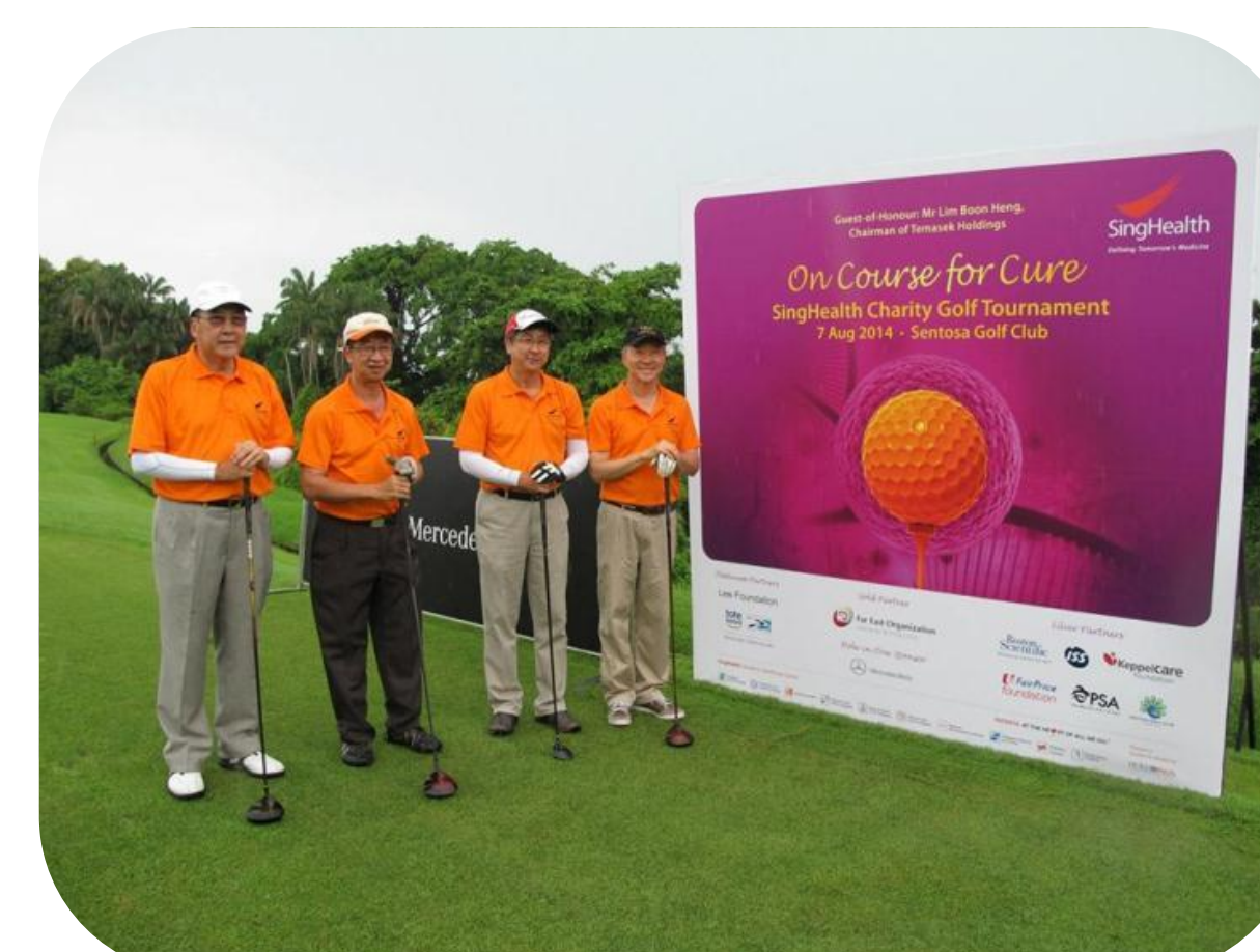
SingHealth Charity Golf 2014