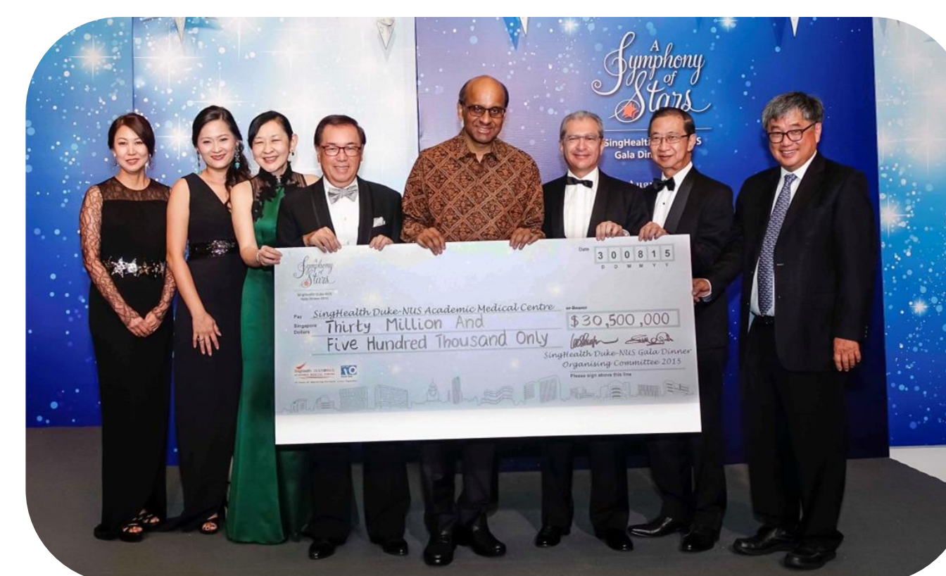
SingHealth Duke-NUS Gala Dinner 2015

As a part of the transformational journey in healthcare philanthropy, the SingHealth Development Office (DVO) conceptualised a donor stewardship framework as a key strategy for the cultivation of potential donors and stewardship of donors.