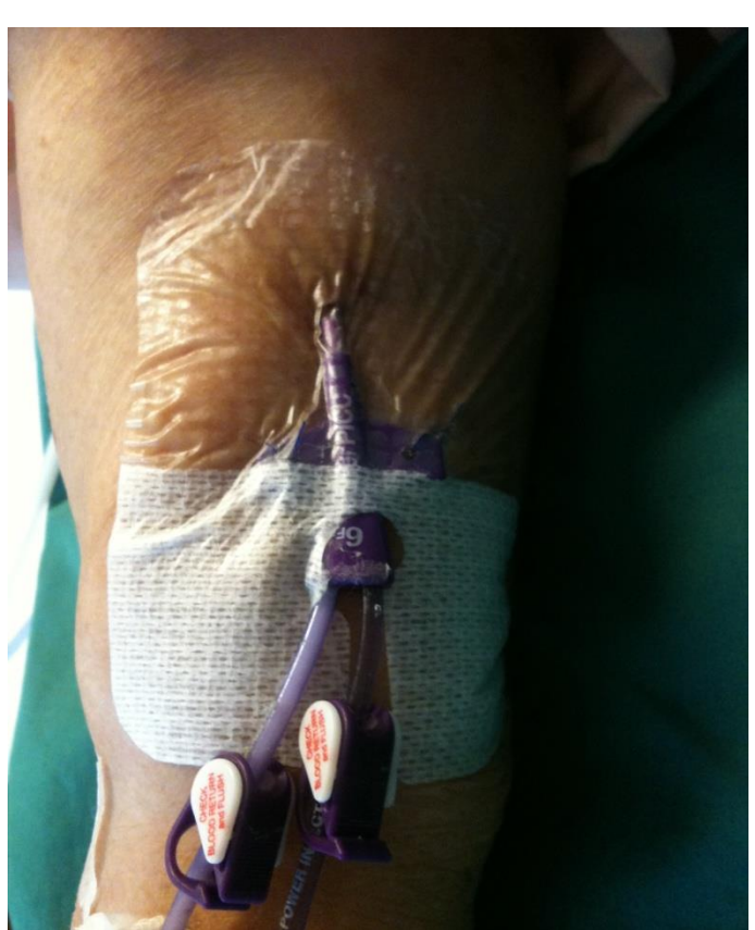
Fig. 1 Current PICC line dressing