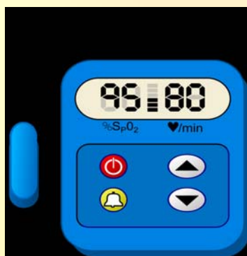
Medical Device #2