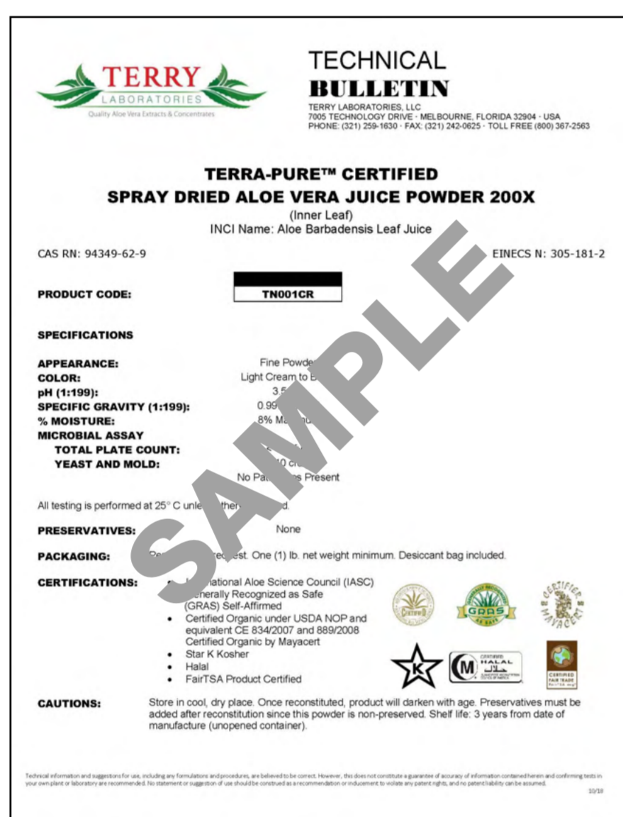
Product Data Sheet