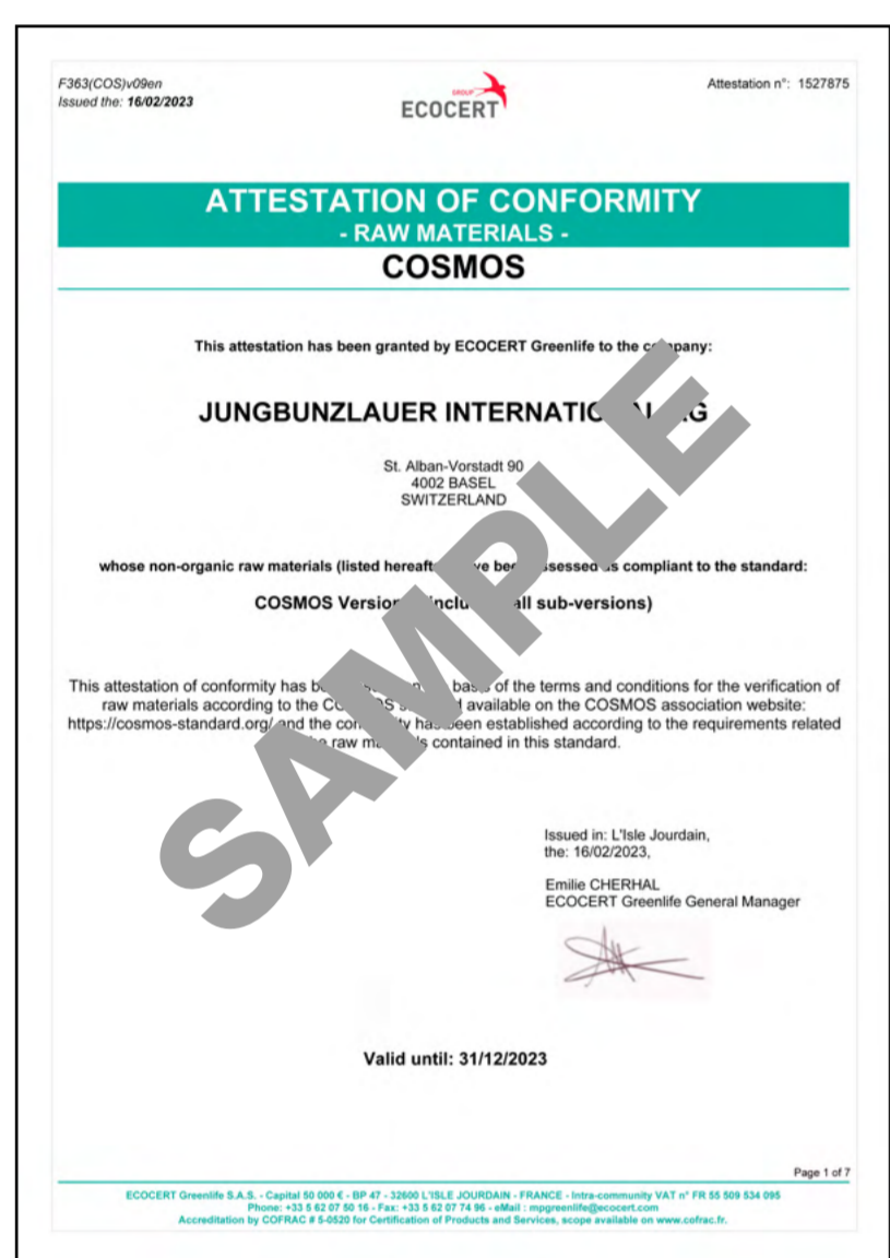
Certificate of Origin, Natural certifications (e.g. COSMOS, Natrue, Ecocert)

There are 3 types of documents our Research and Development (R&D) Team uses to review and evaluate each ingredient to determine biodegradability before using the ingredient in the formulation.