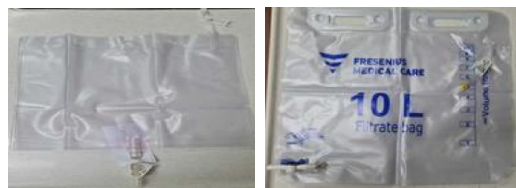
Figure 2. Process of effluent fluid drainage