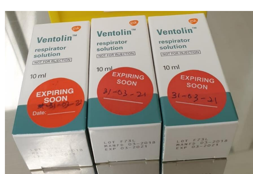
"Expiring soon" SALBUTAMOL SULF 100MCG INH 200D

2. ALPS staff pastes orange 'expiring soon' labels on those expiring less than 6 months.