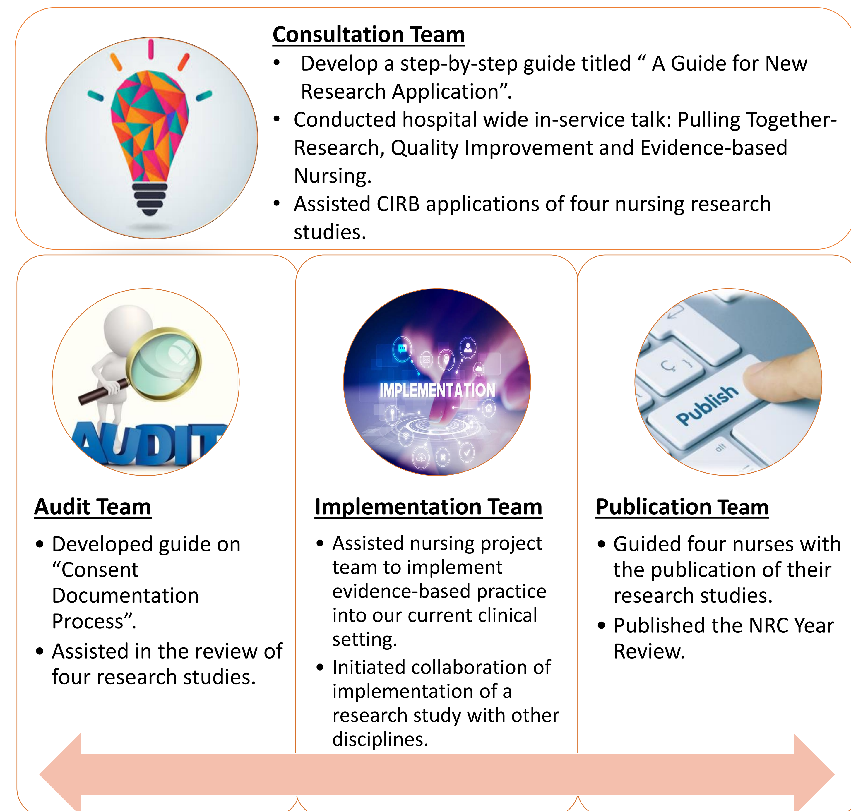
Figure 2: Summary of NRC activities in 2020

The following are some of the end products of these activities.