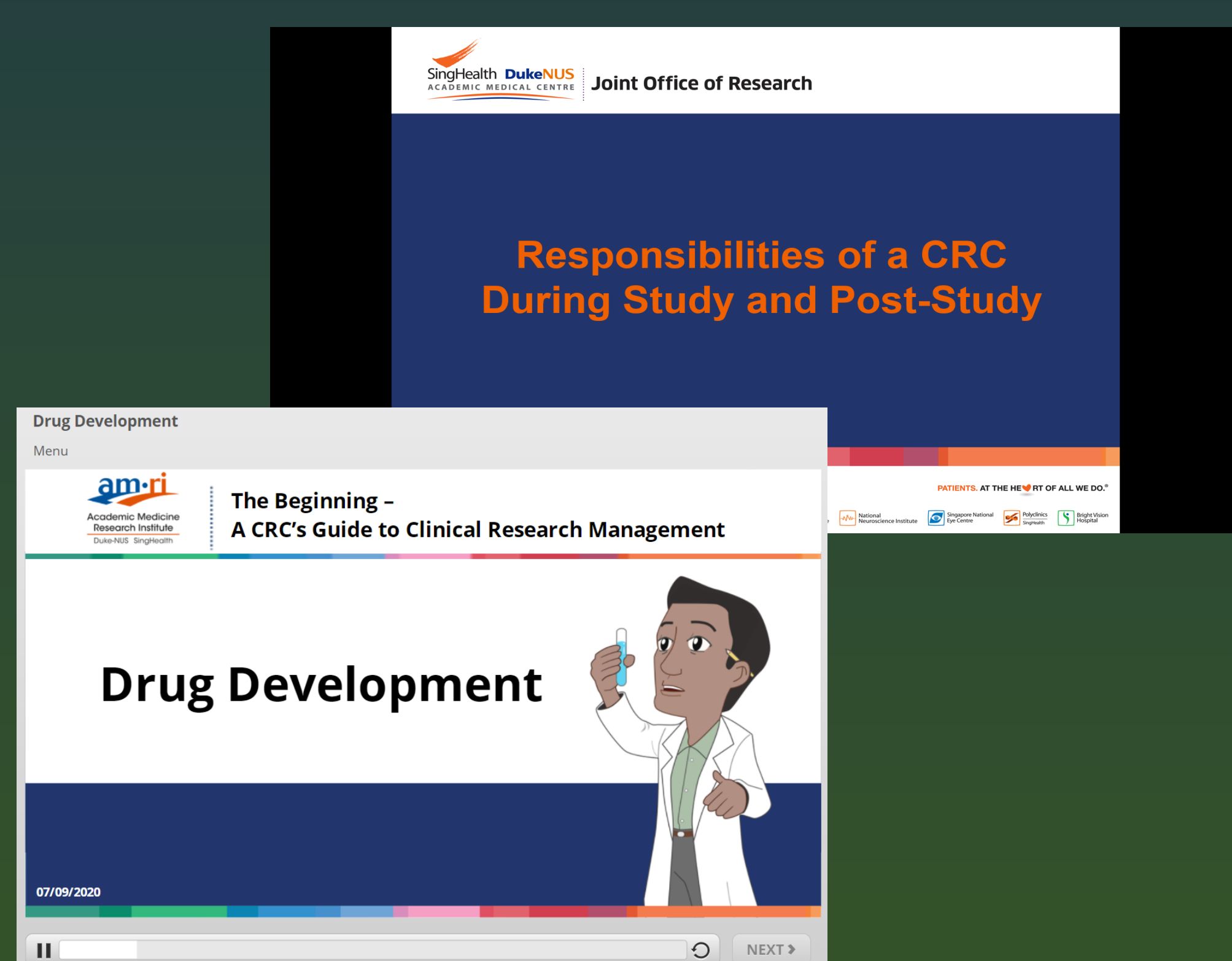
Figure 2: Screen capture of a self-directed e-learning module and zoom webinar

The change in the mode of training has proven to be successful. From this experience, CTCC has started the conversion of other training courses into full remote learning.