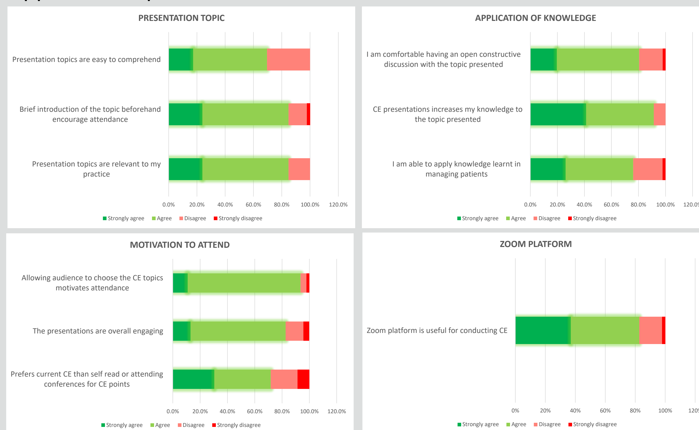
Figure 4. Post-implementation survey results

Based on the results of the post-implementation survey (Figure 4), more than 80% agreed that topics were relevant to practice. Eighty percent of the respondents agreed that by having a brief introduction of the topics beforehand had encouraged them to attend CPE. Almost 80% agreed that topics were easy to comprehend and were applicable to practice.