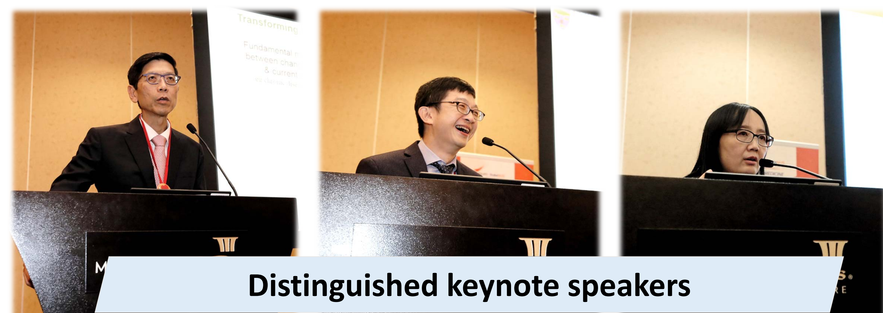
Distinguished keynote speakers