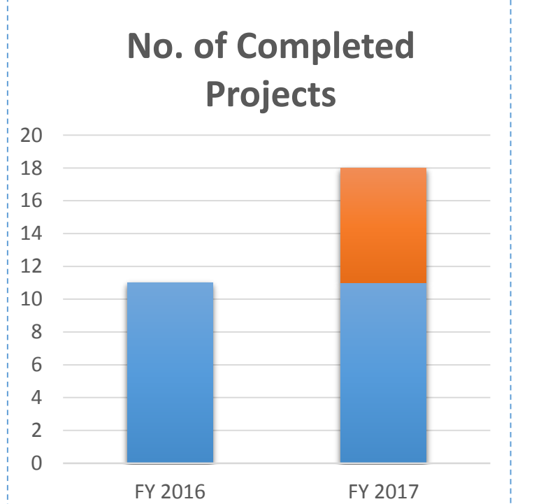
E.g. of data from Div Med/ Med ACP QI Database