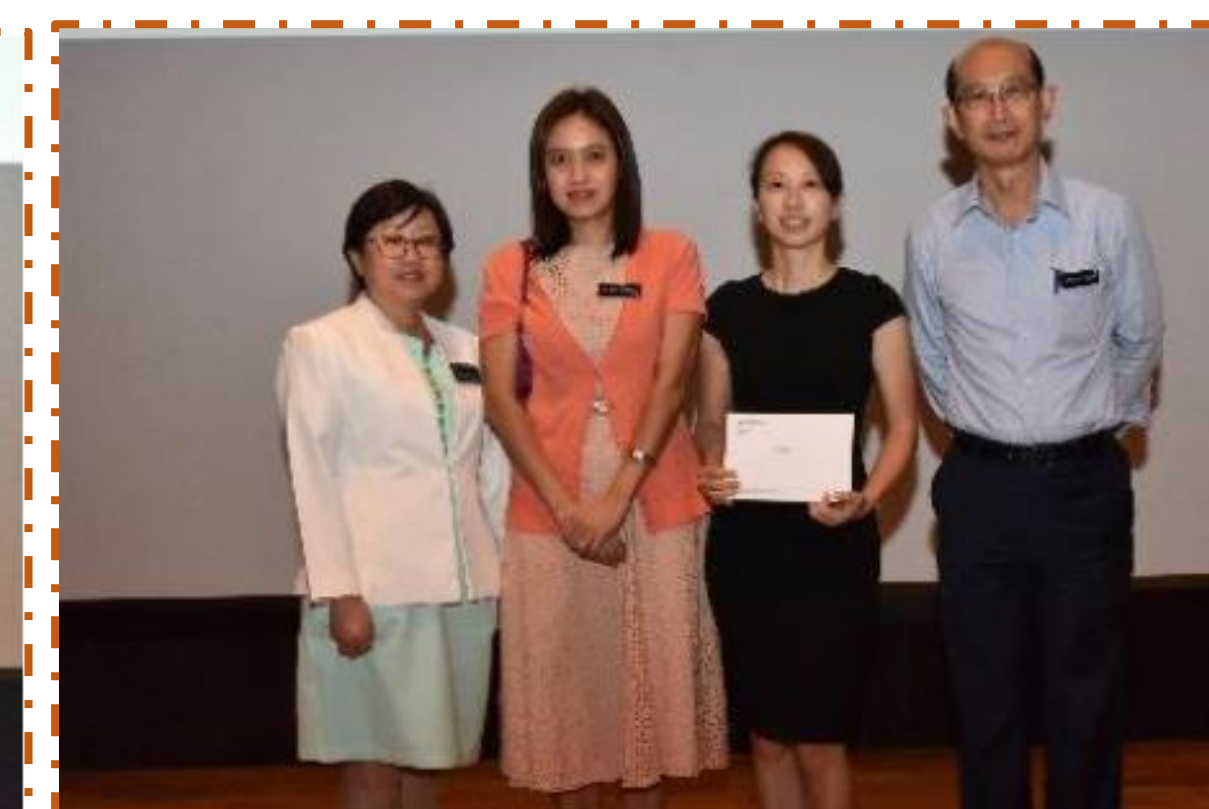
Decrease Post-Op ALOS of Hip fracture patients Project