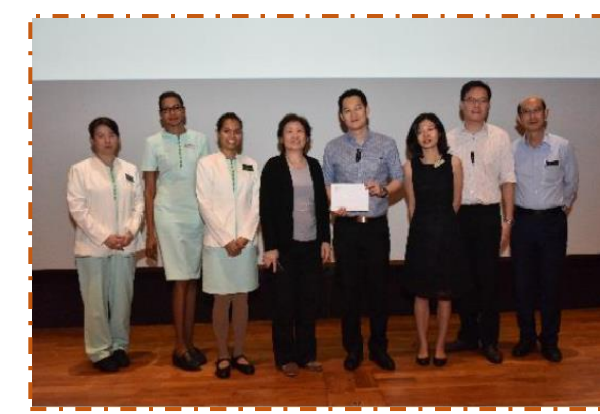
Stop Catheter Related Infections (CRI) Project