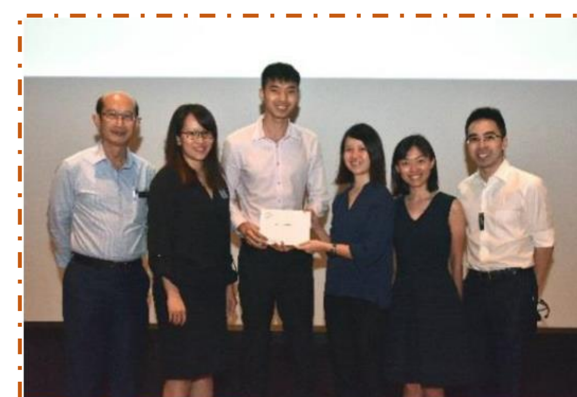
Clinical Handover Project