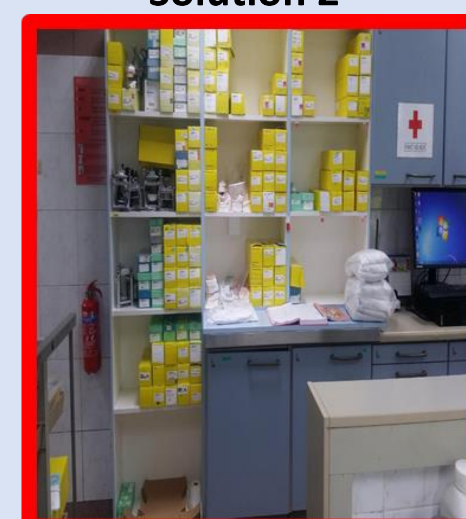
To store non-urgent cases at the storage area provided