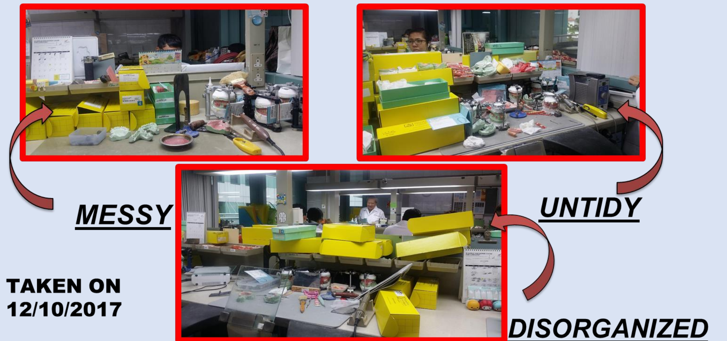
INSUFFICIENT WORKING SPACE