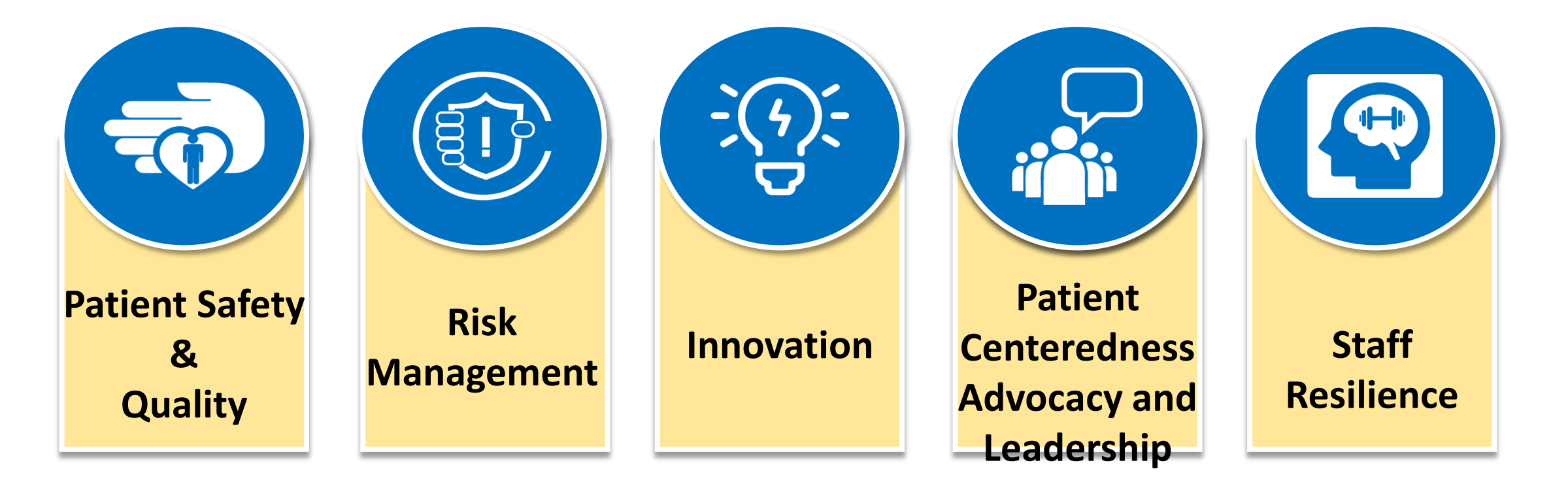
Fig.2 AM-EPIC domains

New domains were created and many PSQ courses have been or are being developed and aligned to the 4 level PSQ framework stated in 4.1. (See Fig 2 & 3)