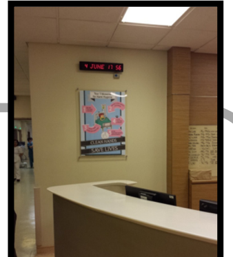
Posters and large format stickers