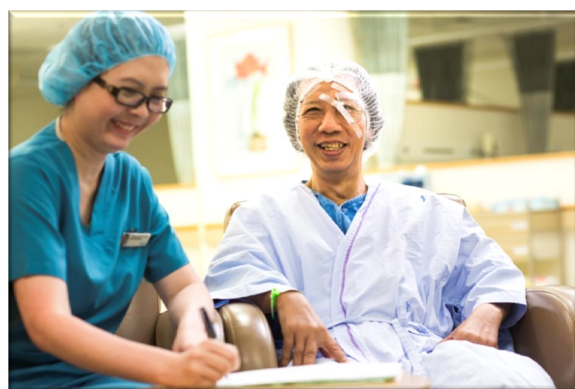
Patient dons a kimono over his street clothes