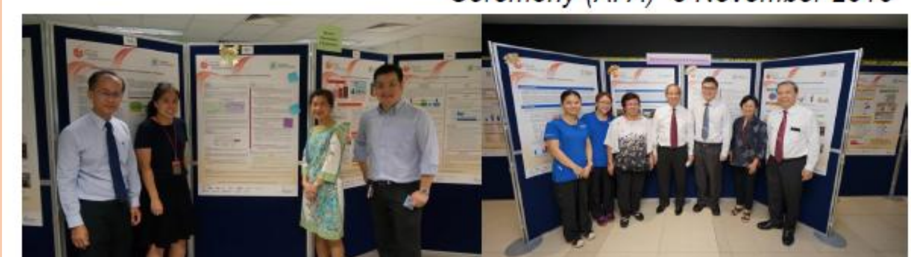
Singapore Health Age-friendly Award Ceremony (AFA) 8 November 2016

Involving academic institutions like UniSIM and Temasek Polytechnic and ILTC partners like Ren Ci Hospital and Ang Mo Kio-Thye Hua Kwan Hospital, Orange Valley Nursing Home, NKF, Man Fut Tong Nursing Home