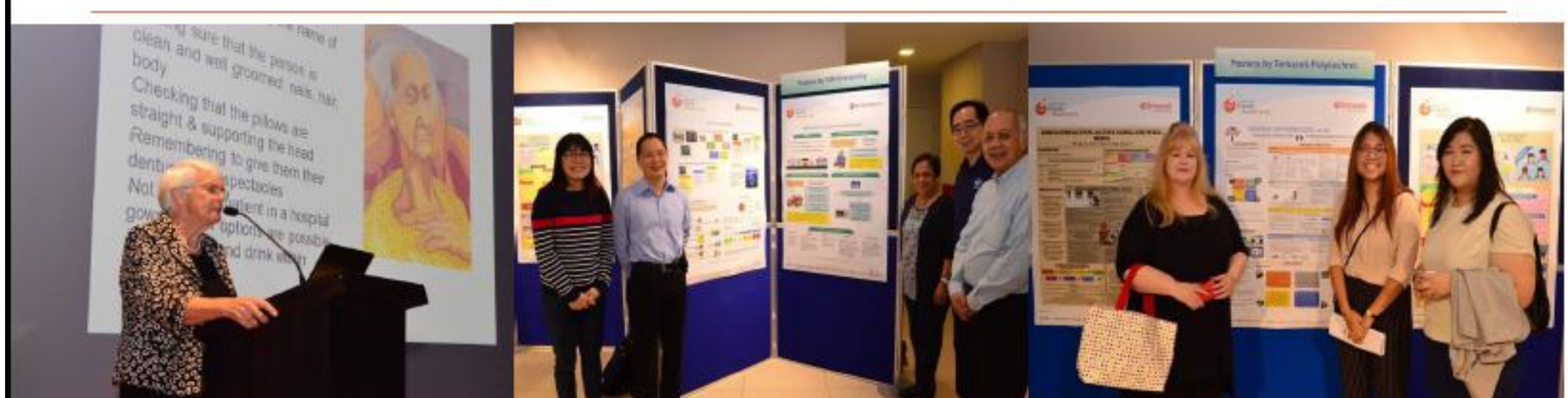
Singapore Health Age-friendly Award Ceremony (AFA) 24 November 2015

Involving academic institutions like UniSIM and Temasek Polytechnic and ILTC partners like Ren Ci Hospital and Ang Mo Kio-Thye Hua Kwan Hospital, Orange Valley Nursing Home, NKF, Man Fut Tong Nursing Home