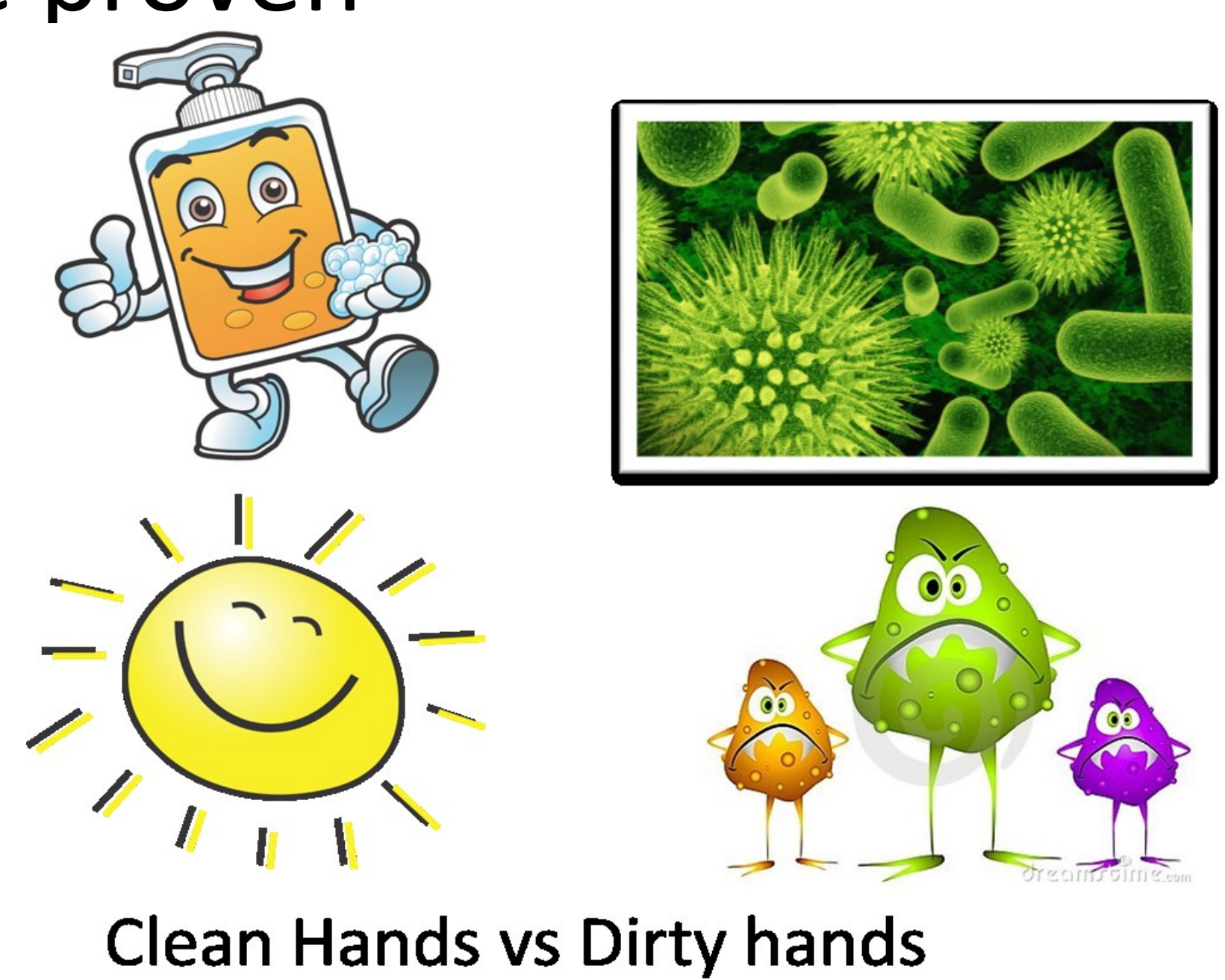
Clean Hands vs Dirty hands