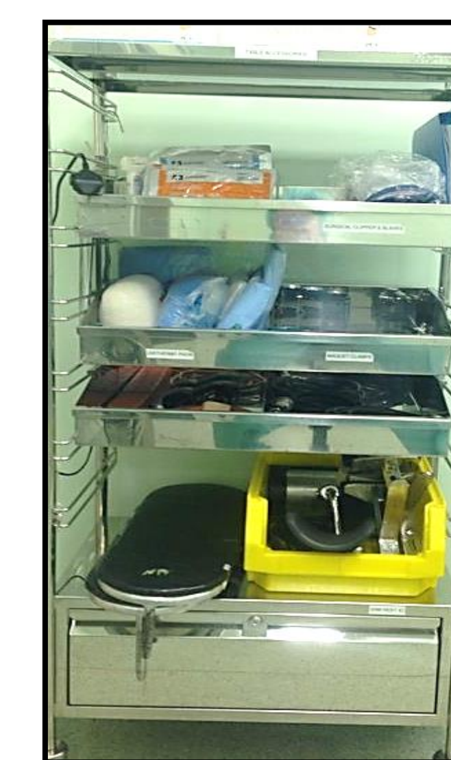
Fig. 3 Completed, reorganized and labeled cart

Now, the cart looks neat & tidy (Fig 3) and OT staff are able to locate positioning aids & accessories easily.