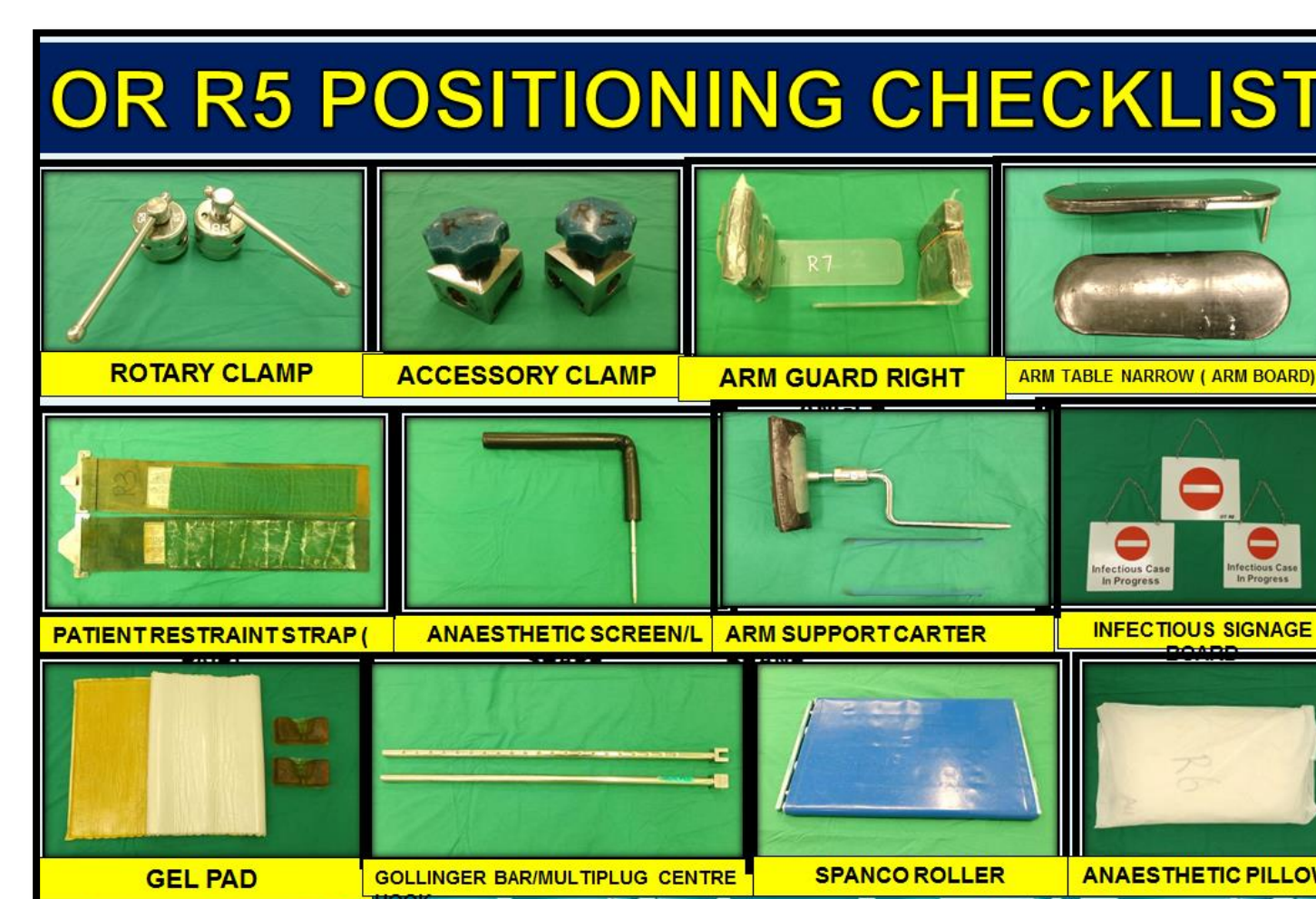
Fig. 4 Labeled Checklist

We implemented the changes to three positioning aids & accessories carts in three ORs.