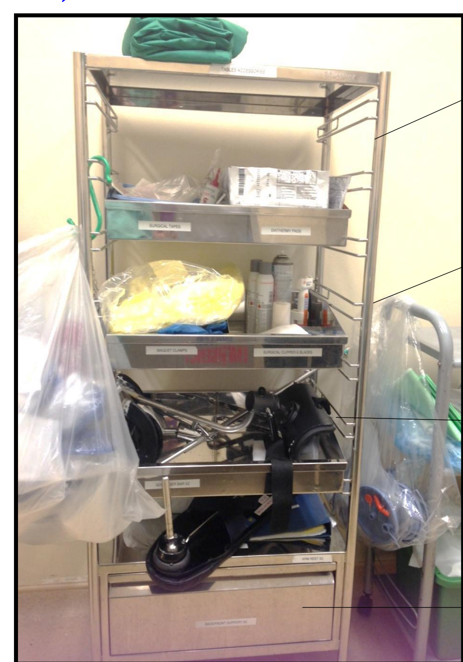
Fig. 1 Positioning aids and accessory cart with items non related to positioning (Mask, gown)

Positioning aids and accessories cart are checked daily by the operating room (OR) ancillary staff using the inventory checklist (fig.2). However, missing or misplaced positioning aids & accessories were still not discovered till the point of usage causing undue stress to OT staff.