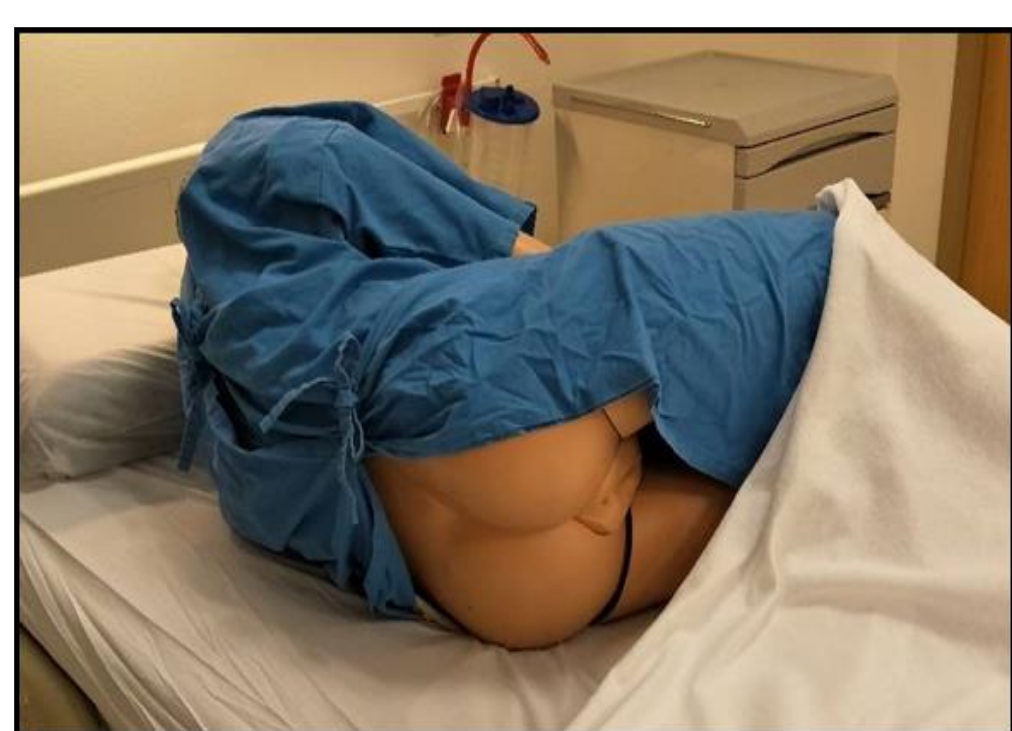
Diagram 1: As-Is Patient with exposed lower half of body

Diagram 1 shows patient in lateral position with procedure gown lifted up to expose lower half of body during the process. Blanket is used to minimize unnecessary exposure. Patients generally feel a sense of embarrassment as they remain conscious throughout with inadequate coverage of the private area. Privi-pants is designed with the intent to preserve patient's modesty during the procedure.