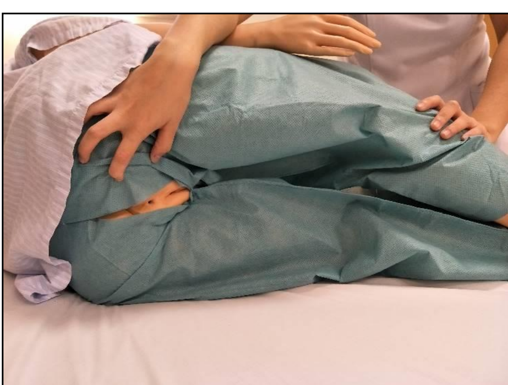
Diagram 2: Sample of disposable pants (obtained overseas) with standard exposure

The team came across a pair of disposable pants with a hole (diagram 2) during a study trip. A search was conducted on return but to no avail as it is not used locally. We reckoned that this disposable pants was able to preserve modesty during procedure to some extent but the standard opening may inevitably result in unnecessary exposure for some patients, and limits mobility due to inadequate coverage from movement during ambulation.