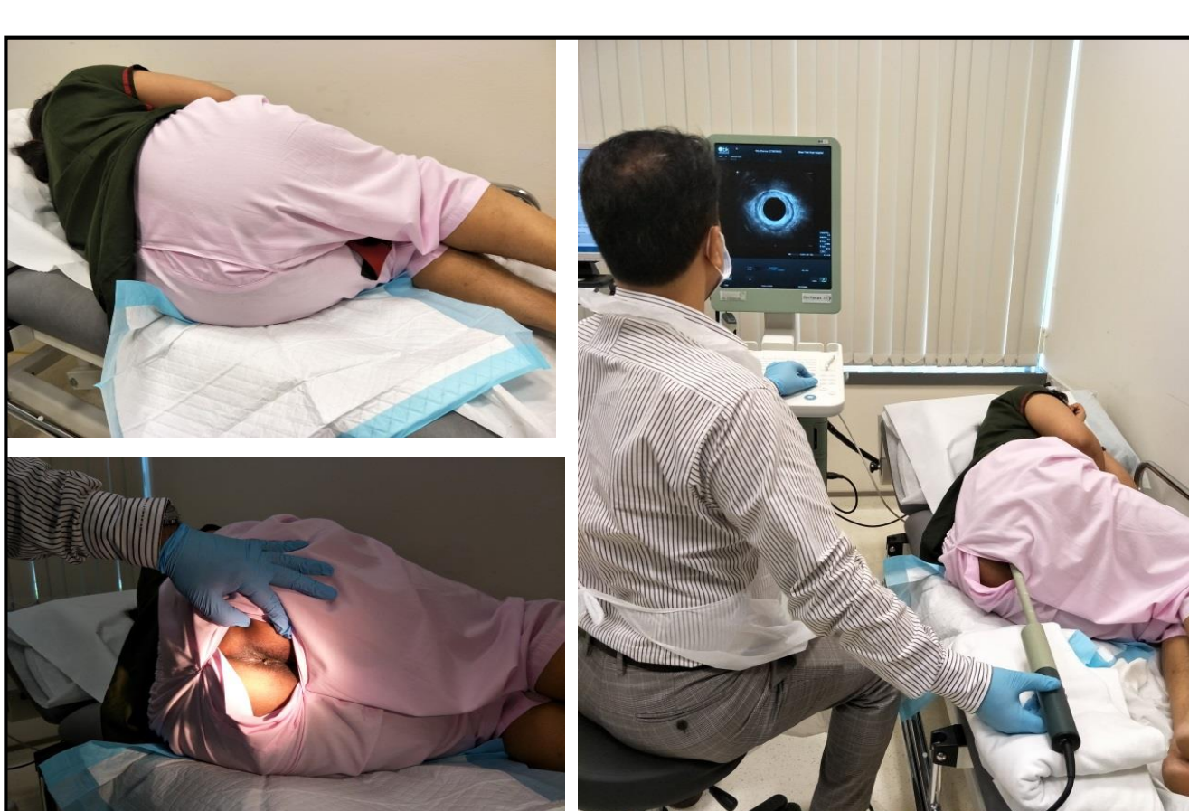
Diagram 4: To-Be Privi-pants in use during procedure