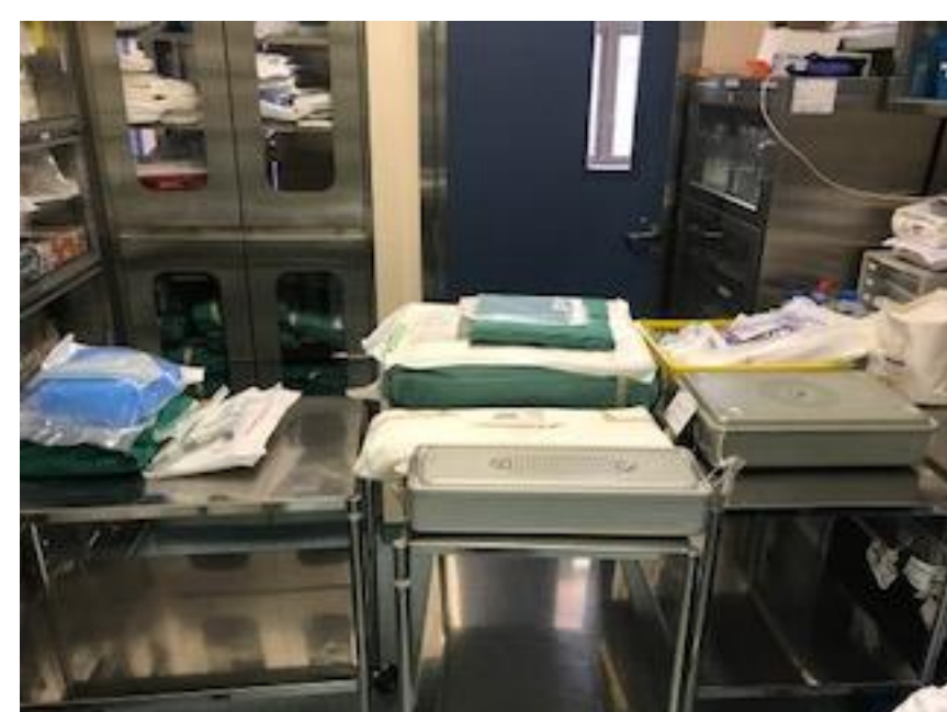
Trolley preparation before QuickPak

To reduce time taken to prepare for (PCNL) procedure by 50% in Urology OT within 3 months.