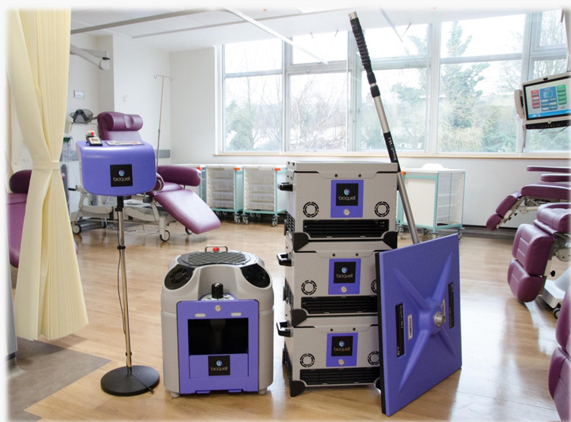
HPV Technology – Bioquell BQ-50

While regular cleaning can reduce the number of bacteria in a patient room, it does not always eliminate them completely and hence posing a risk of infection. Thus there's a need to sought for more efficient method known as Hydrogen Peroxide Vapour (HPV) technology to reduce the microbiological burden and increase in environmental hygiene.