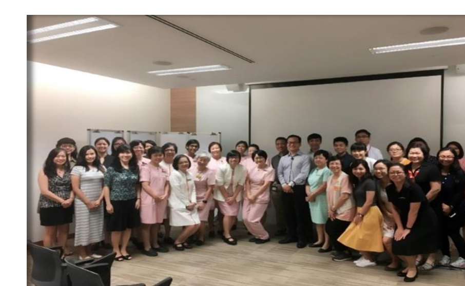
Fig.8. Essential Human Factors for the Healthcare Professional