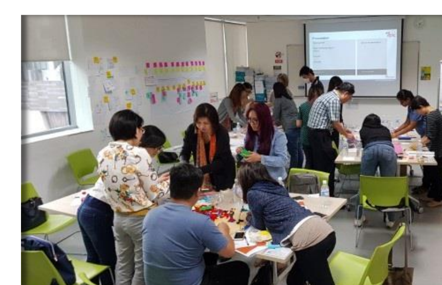
Fig.7 Introduction to Design Thinking Workshop