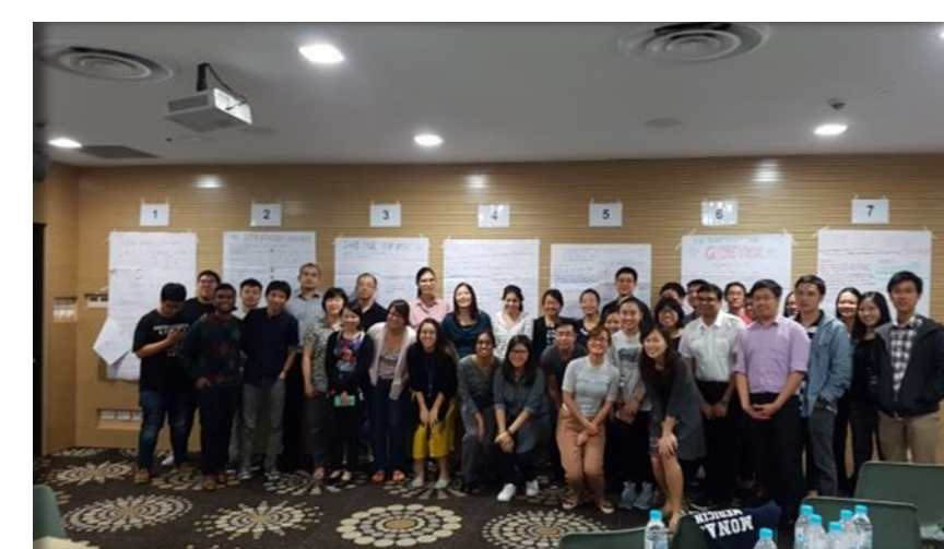
Fig.5 QI Workshop

Cross sharing of training manpower, resources and facilities at cluster level has been established. (See Fig 5,6,7,8)