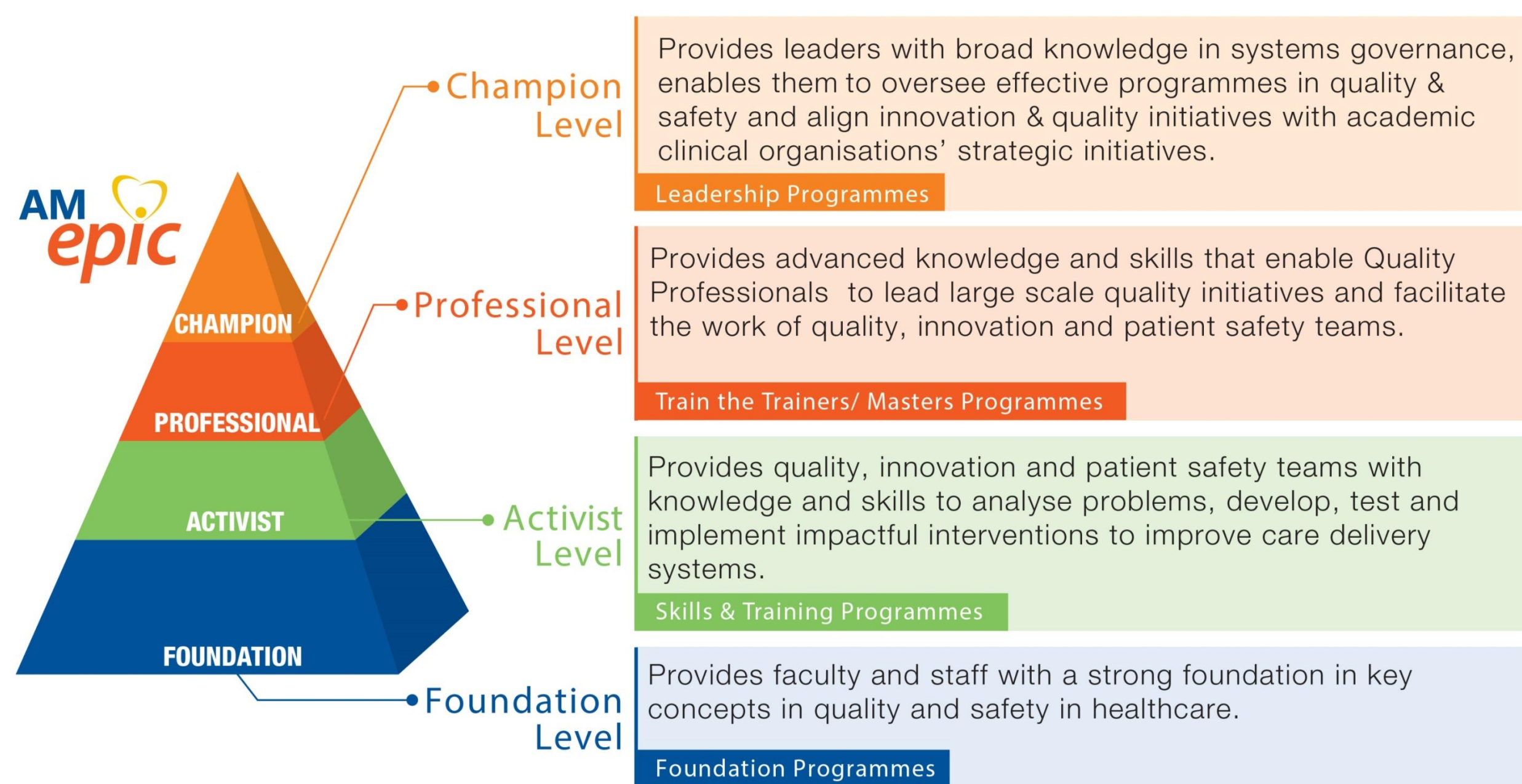
Fig.1 AM-EPIC competency framework for PSQ

A 4-Level PSQ competency framework (Foundation & Activist levels to Professional and Champion levels) has been created. (See Fig 1)