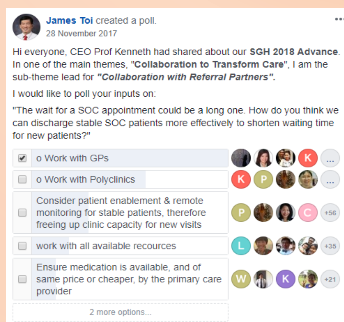
Figure 2. One of the thematic posts gathering ~500 responses & 6 comments