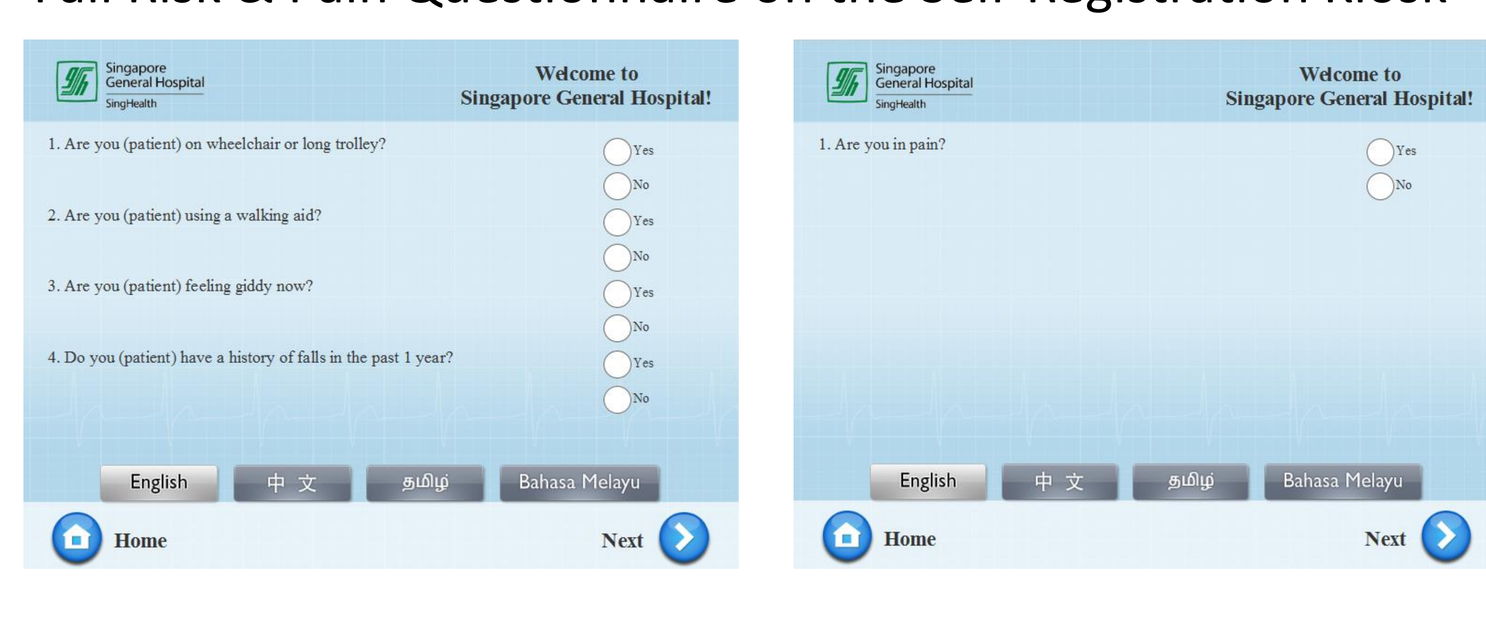
Fall Risk & Pain Indicator on 1Q System

Fall Risk & Pain Questionnaire on the Self-Registration Kiosk